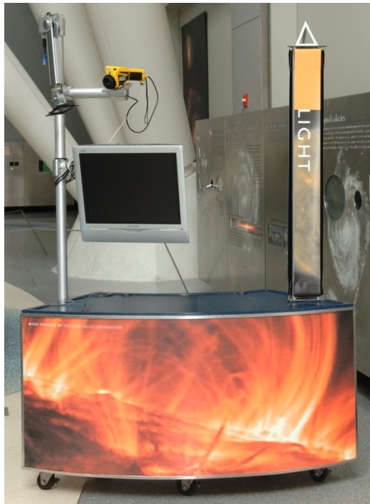
Figure 1. Picture of the “light” activity cart. Notice the infrared camera and monitor attached to the vertical pole on one side of the cart. Each cart could fit two interns comfortably behind them. They were mobile, but could be locked in place during use.

During regular Museum hours, all three of the carts were placed on the periphery of the (roughly circular) Hall of the Universe, each separated by less than 20 meters. The Hall of the Universe has exhibits on important topics within astronomy, such as planets,