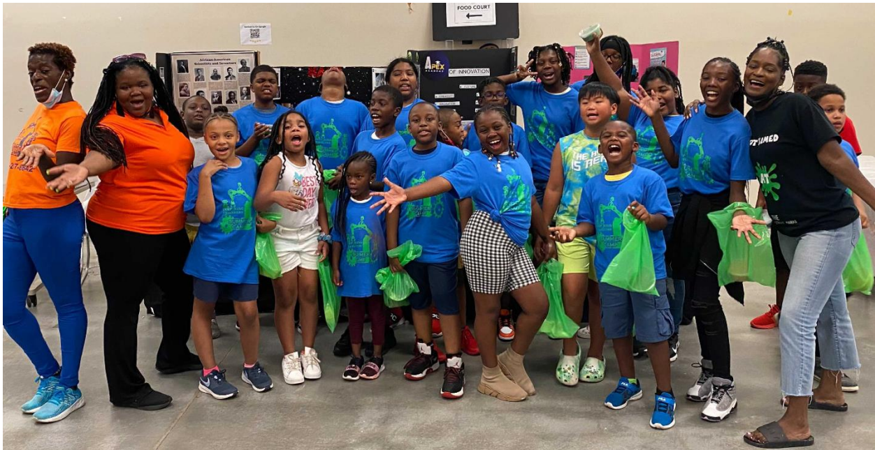
Students in a SciGirls in Space afterschool program in South Carolina.