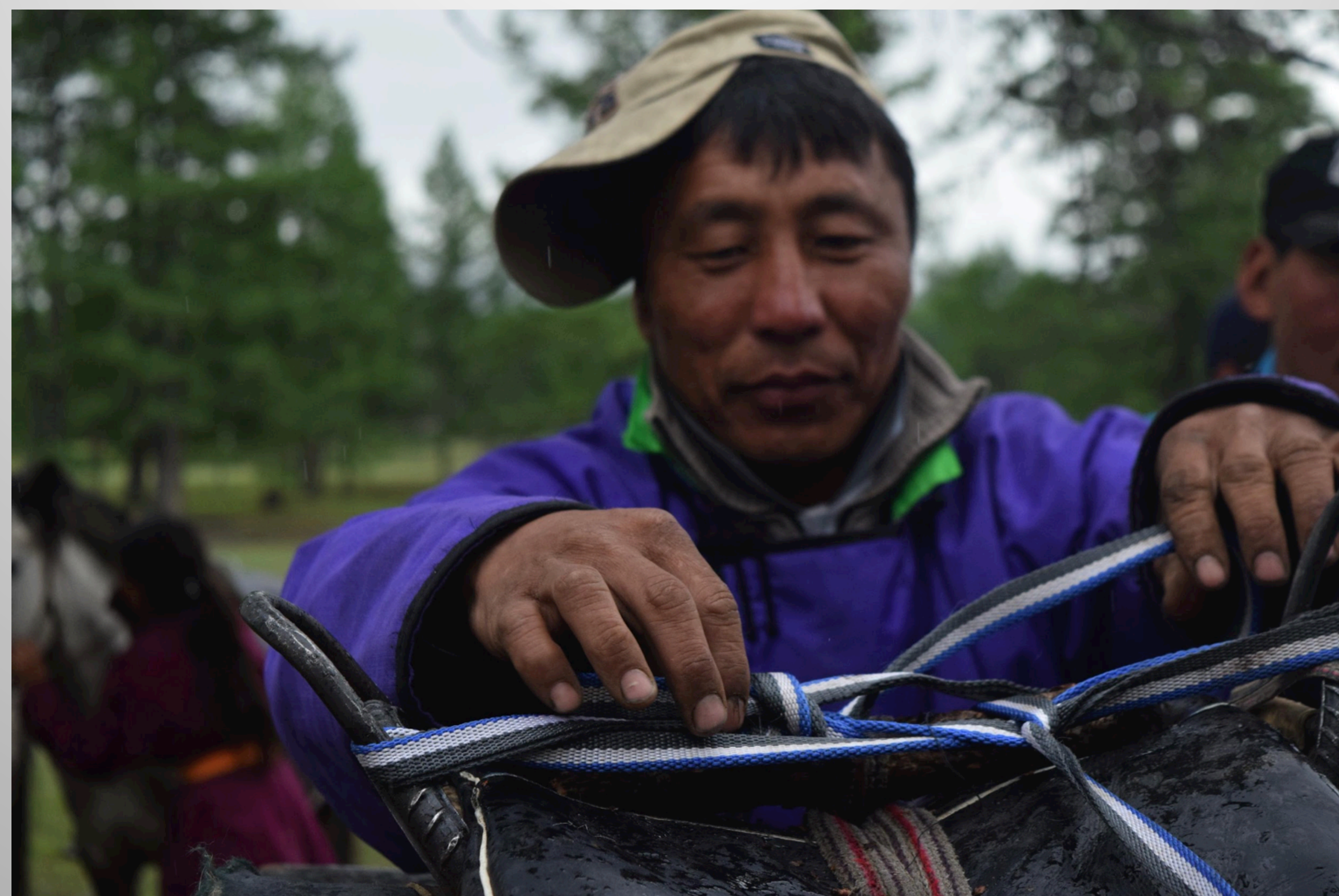
A ranger demonstrates how to pack a horse in Ulaan Uul, Mongolia