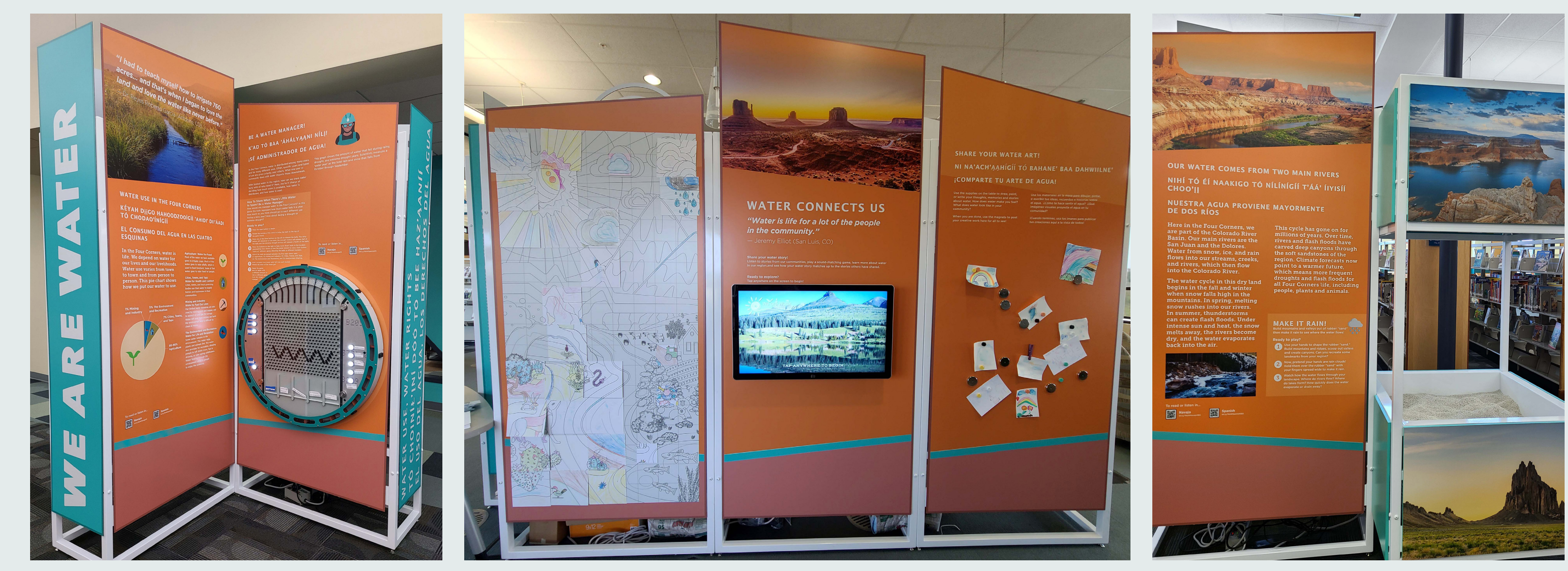
We are Water exhibit at the Carbon Valley Regional Library.

We are Water springs from an exciting collaboration between scientists, Indigenous science educators, learning researchers, informal educators, and library staff.